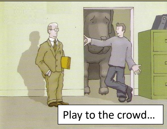
Play to the crowd...