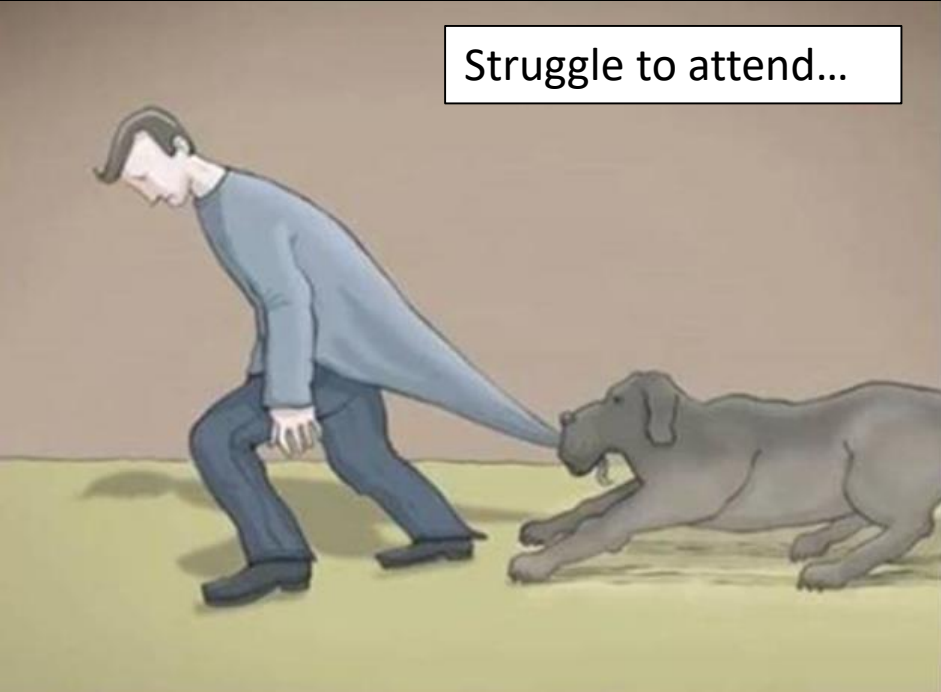
Struggle to attend...